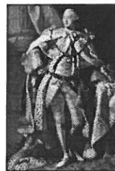
← King George III

Montesquieu studied the laws, customs, and governments of European countries to see how they created and enforced laws. He admired the government of England. The English government had three parts: a king to enforce laws, Parliament to create laws, and courts to interpret laws. The government was divided into parts, and each part had its own purpose. Montesquieu called this the separation of powers .