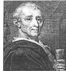
Baron de Montesquieu

Charles Louis de Secondat was born in 1689 in the city of Bordeaux, France. At age 27, he became Baron de Montesquieu (MON-teh-skew) when he inherited his uncle's fortune and title. Montesquieu was one of the great thinkers of the 17th and 18th centuries. He spent a lot of time thinking about how governments should be created and maintained. His ideas guided the Founding Fathers when they wrote the United States Constitution. Even today, Montesquieu's thinking influences the way people think about government around the world.